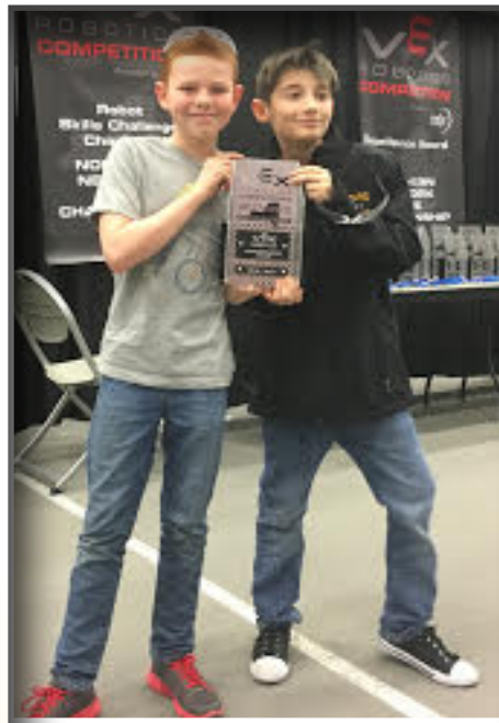
A picture of one of our 7th grade teams who earned the Northern New York State Championships "Team Work" award last year in Syracuse.

will be held at the Fallsburg Jr./Sr. High School Gym on Saturday, December 2, 2017. This event co-sponsored by the Fallsburg and SUNY Sullivan Robotics Teams and admission for audience members is free! The event has been moved to the Jr./Sr. High School gym to make room for new teams from our area, and additional teams from throughout New York State. The VEX Robotics Competition, presented by the Robotics Education & Competition Foundation, is the largest and fastest growing middle school and high school robotics program globally with more than 18,000 teams from 40 countries playing in over 1,350 competitions worldwide. VEX Robotics Competitions focus on teamwork and problem solving through STEM-based education.