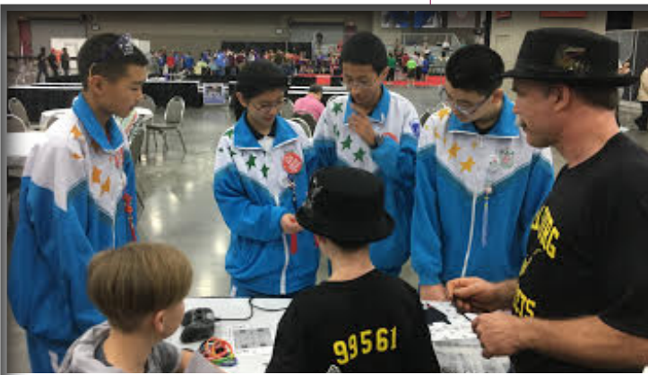
A picture of our other 7th grade team who last year earned the opportunity to represent all New York State middle schools at last years VEX World Robotics Championships in Louisville KY. They are discussing strategy with their next alliance partners from China.

The Second Annual Catskill New Bot Battle - VEX Robotics Competition