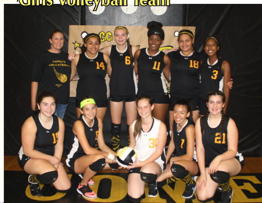
Girls Volleyball Team