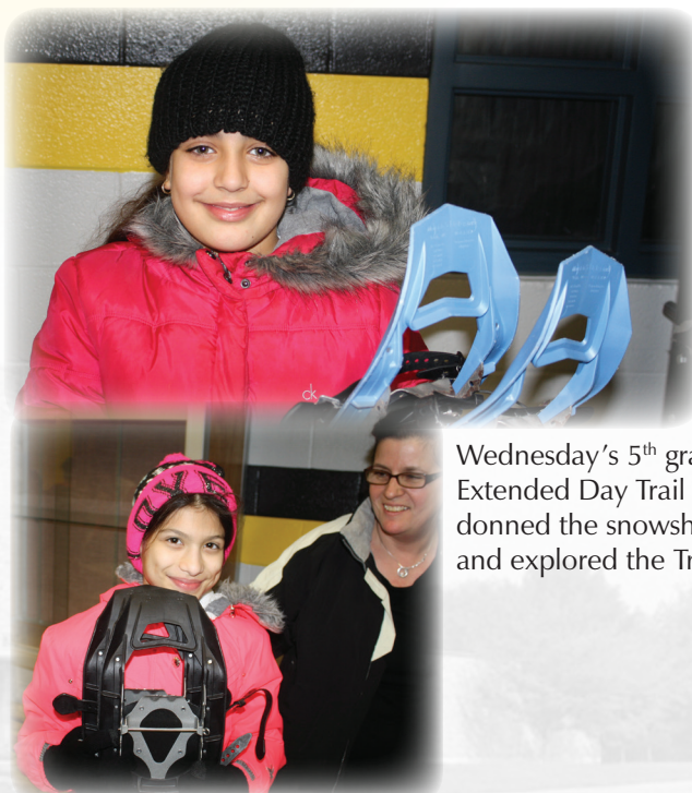
Wednesday's 5 th grade Extended Day Trail Group donned the snowshoes and explored the Trail.

pair of adult sizes. CCE donated 8 of the smaller ones and the adult pairs. FCSD obtained the balance through the Renaissance Grant. After a two inch snowfall on January 31 st , the