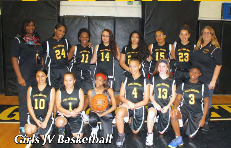
Girls JV Basketball