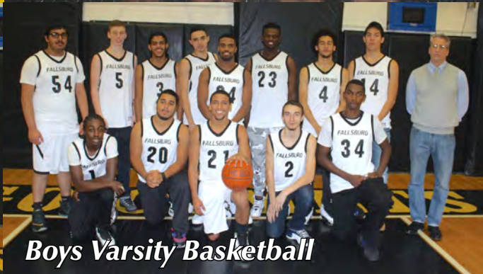
Boys Varsity Basketball