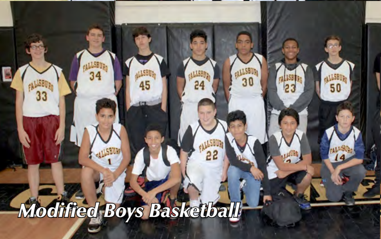
Modified Boys Basketball