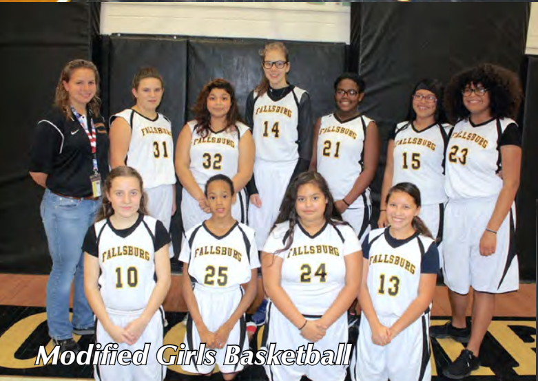
Modified Girls Basketball