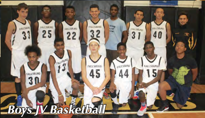
Boys JV Basketball