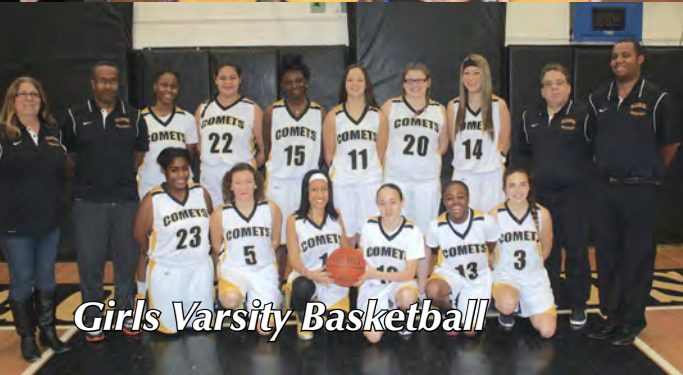
Girls Varsity Basketball