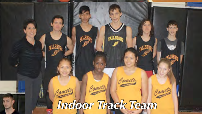
Indoor Track Team