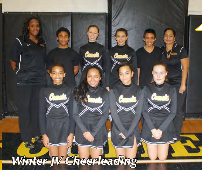
Winter JV Cheerleading