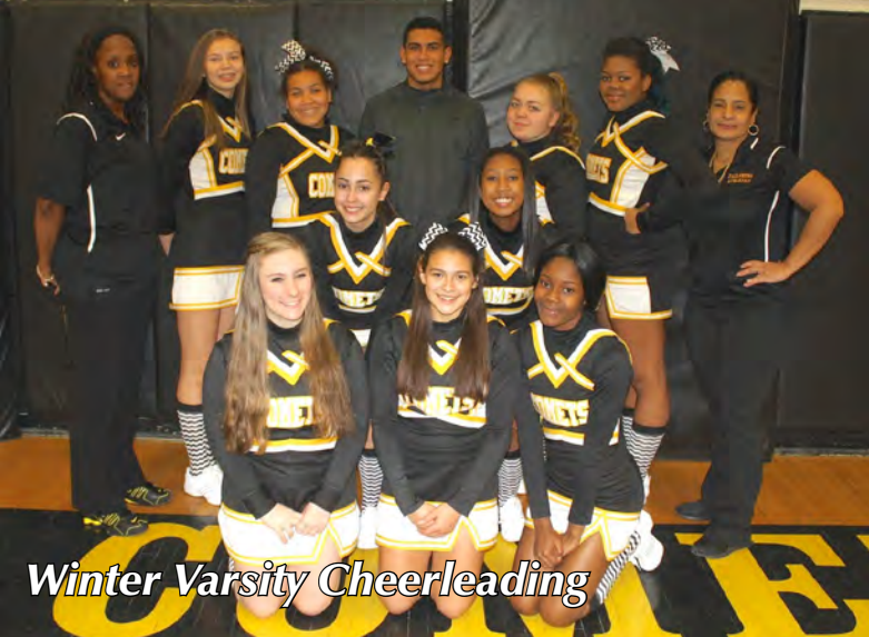
Winter Varsity Cheerleading