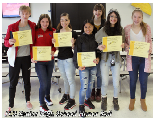
FCS Senior High School Honor Roll

This year the School Administration and the Student Government Association (SGA) presented Honor Roll students from the First Quarter of 2018-2019 with special breakfasts at the