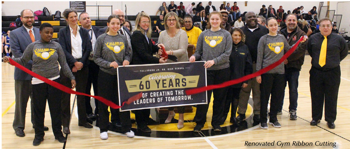
Renovated Gym Ribbon Cutting

Town Board and Police Department. Members of the Sullivan County Legislature and the State of New York Legislature, including the Honorable Jen Metzger, newly elected Senator for the 42 nd Senate District, came to celebrate the occasion.