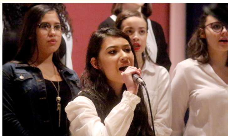
BCES chorus students participating in this year's SCMEA All County Music Festival are: