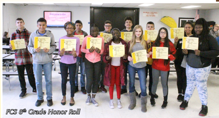
FCS 8 th Grade Honor Roll

opening of the school day in the cafeteria. Seventh and eighth graders received their awards on Friday, November 16 th , and ninth through twelfth graders received theirs on Monday, November 19 th .