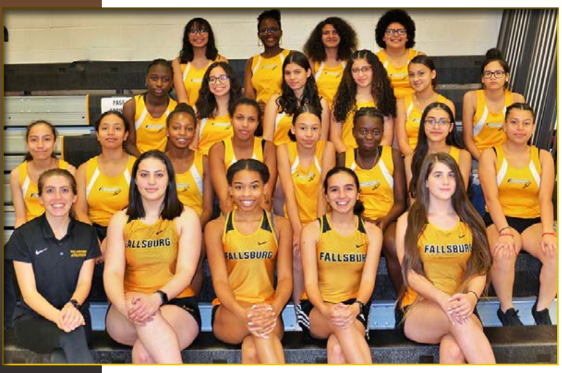
Varsity Girls Indoor Track