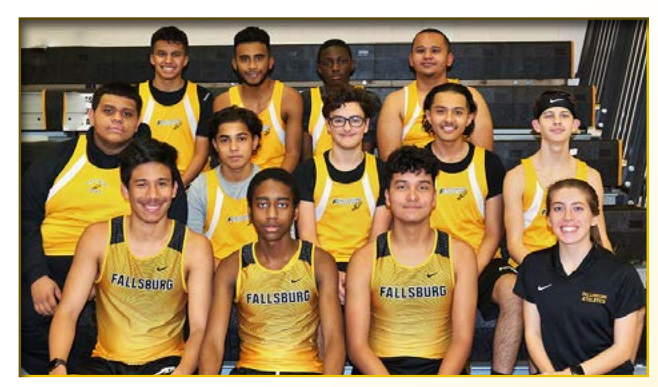
Varsity Boys Indoor Track