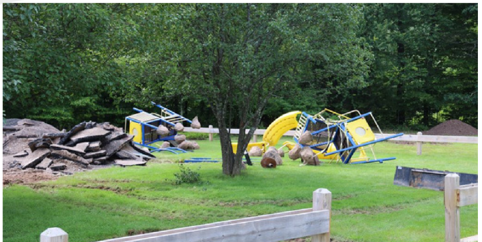
BCES playground under construction