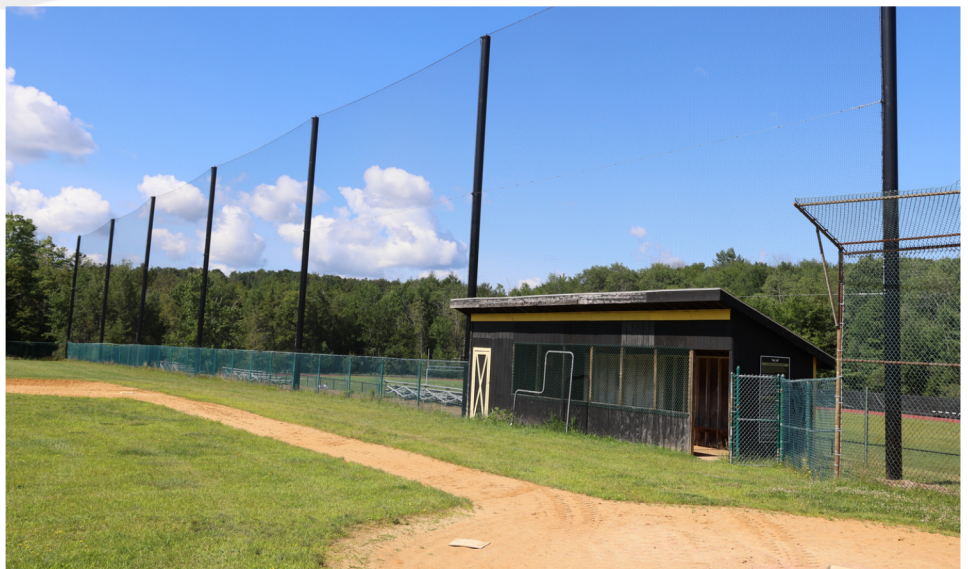
Safety netting along first base line

Restoration has begun at the softball field, located at the Benjamin Cosor Elementary School. Existing material has been removed from the infield and replaced with six inches of new sand and material. A new drainage system will also be installed; running from the left field fence to the backstop. Continued on next page