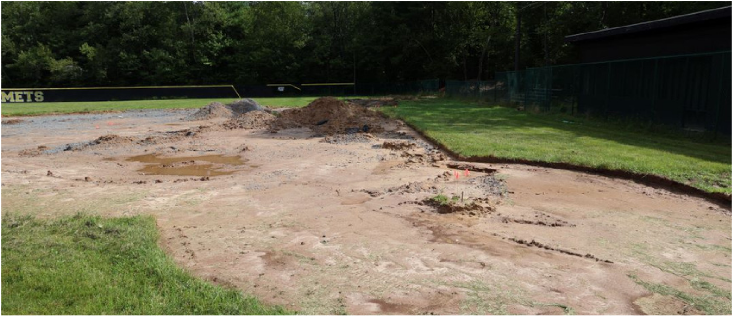
Material removed from softball field

The perimeter, area around the batter's box, first and third base lines, and the arc from first to third base will be re-sodded. First, second, and third bases, home plate, and the pitcher's mound will be replaced. The project is anticipated to be completed before the start of the school year.