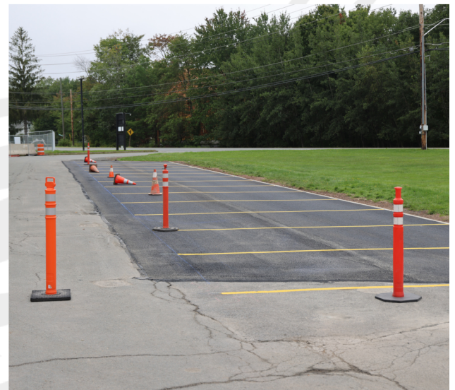
Expanded parking in JSHS front lot

Benjamin Cosor Elementary School will see upgrades to their recreational areas by the start of the school year. The two playgrounds will be replaced with brand new equipment, benches, and trash bins.